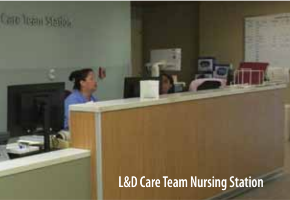
L&D Care Team Nursing Station