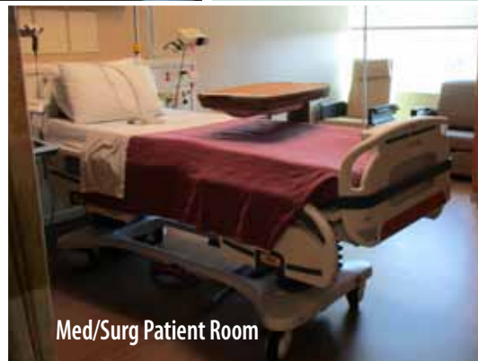
Med/Surg Patient Room